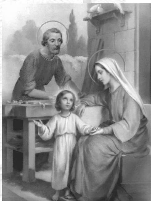
"The Family That Prays Together Stays Together" - Fr. Patrick Peyton, CSC